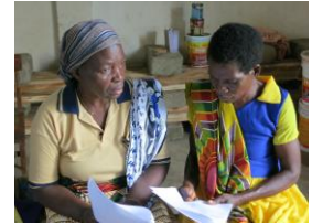
RinJ in Uganda