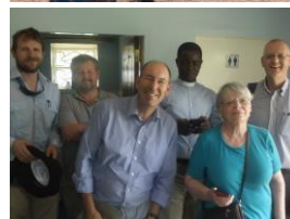
RinJ in South Africa