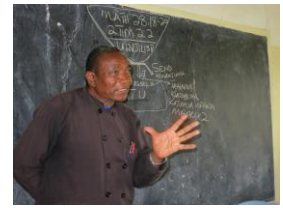
RinJ in Tanzania

It is particularly heartbreaking that since the conferences in October the violence has