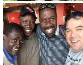
RinJ in South Sudan